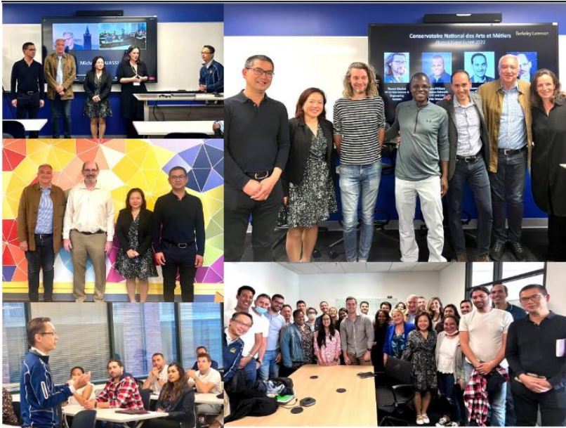
CNAM Custom Program - 2nd cohort - Summer 2022