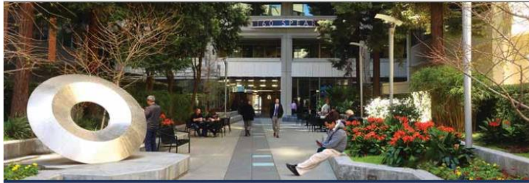
UC Berkeley Extension - San Francisco Center 160 Spear Street San Francisco, CA 94105