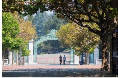
UC Berkeley - Main Campus