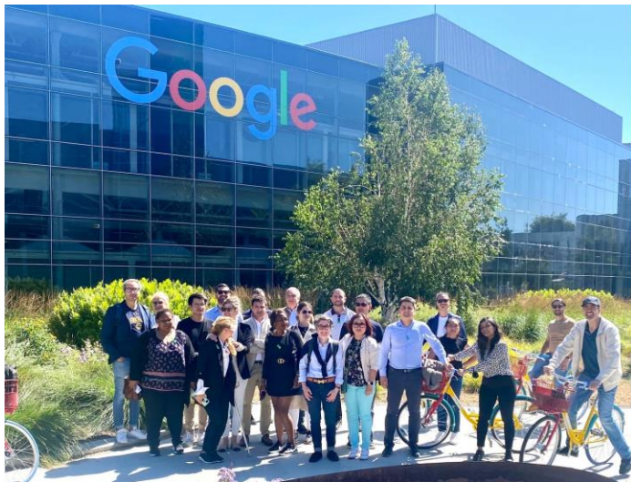
Google Headquarters - Summer 2022