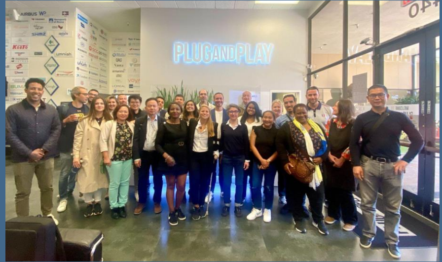
CNAM Custom Program - 2nd cohort - Summer 2022