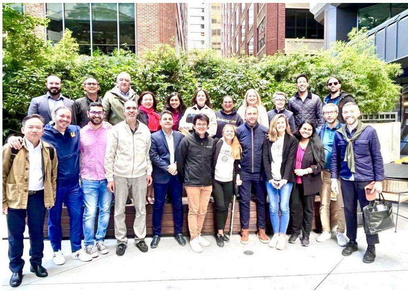
UC Berkeley Extension - San Francisco Center - Summer 2022