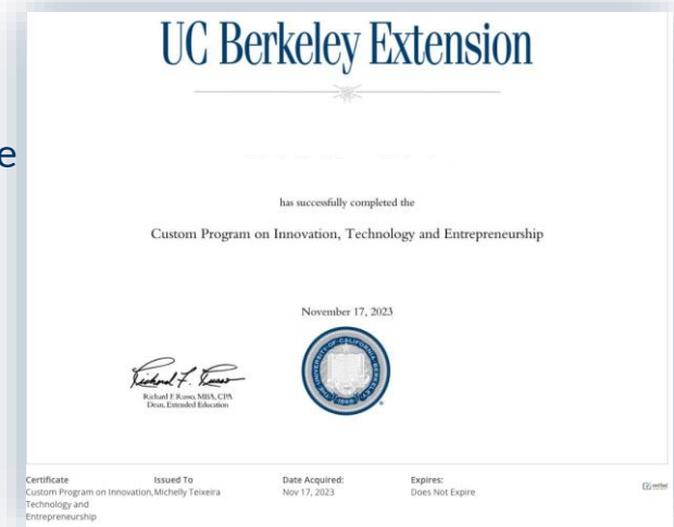
Digital version of certificate