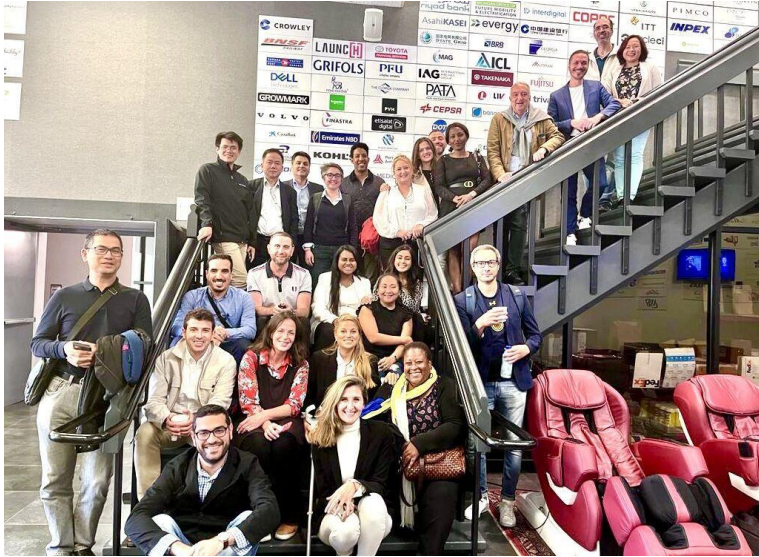
Plug And Play - Summer 2022