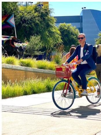
A wild cyclist from CNAM