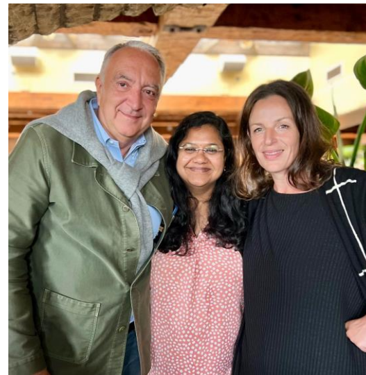
San Francisco networking event