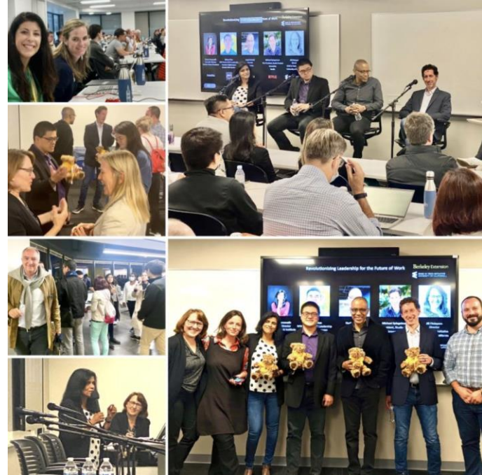
Public Panel Event - Summer 2022 Revolutionizing Leadership for the Future of Work